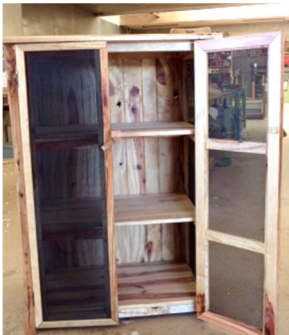
BECOME A BEAUTIFUL MEAT SAFE LIKE THIS