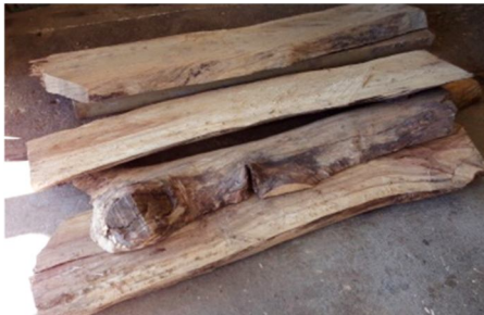
SLABS LIKE THIS

Pictured below are two examples of transformation of raw material by a couple of our Shed members showcasing their diverse talents.