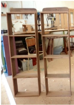
TIMBER FROM THE YARD BECOMES BOOKSHELVES